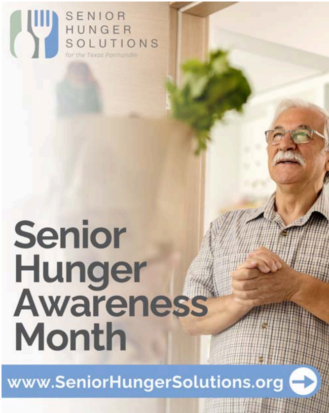
Senior Hunger Awareness (1)