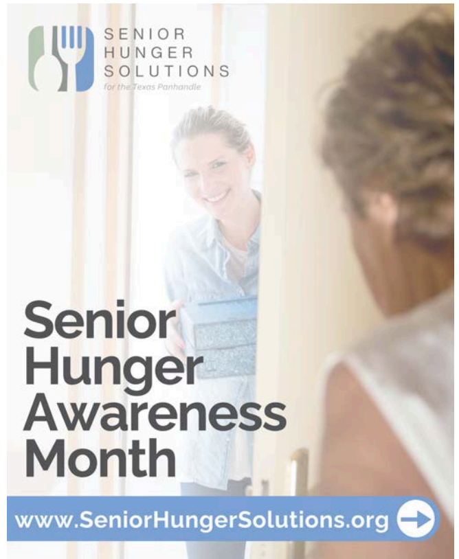
Senior Hunger Awareness (4)