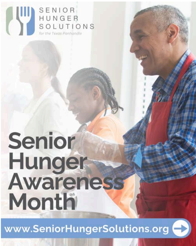
Senior Hunger Awareness (3)